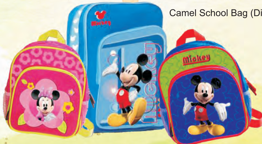
Camel School Bag (Disney Licensee)