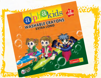
Washable Crayons (XL)