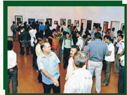
11th Western Region - CAF Nehru Center