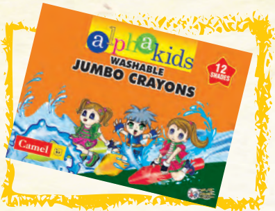
Washable Jumbo Crayons