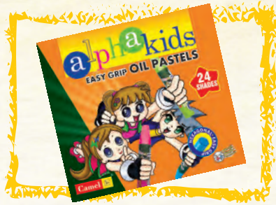
Easy Grip Oil Pastels