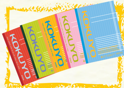
Kokuyo Note Books