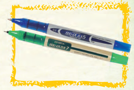
Zebra Pen 0.5mm and 0.7mm